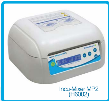
Incu-Mixer MP2 (H6002)