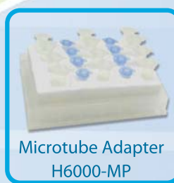
Microtube Adapter H6000-MP

Designed for application flexibility, the Incu-Mixer series is available in two, and four-plate capacities. The four-plate model features an increased chamber height for accepting plates up to 46mm high. Independent time, temperature and speed controls allow the mixer to function as 3 machines in one; a multi-plate incubator, vortexer, or a combination of the two. The Incu-Mixer MP series is ideal for a wide variety of molecular biology applications including immunochemical reactions, enzyme and protein analysis, and microarray analysis.